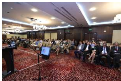
GEWR'17 270 participants 11 countries of the world