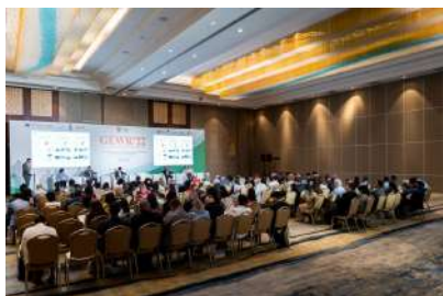
GEWR'22 200 participants 8 countries of the world

GEWR has been held since 2016 among Central Asian and EU countries with the support of the Ministry of Ecology and Natural Resources of the Republic of Kazakhstan.