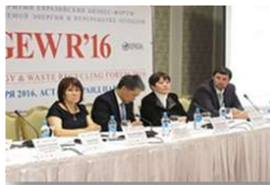
GEWR'16 120 participants 5 countries of the world