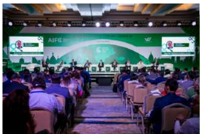
GEWR'18 300 participants 15 countries of the world