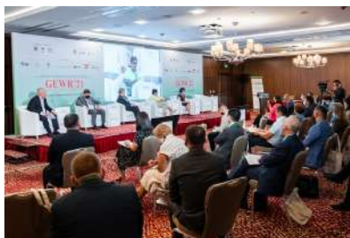
GEWR'21 500 participants online/offline format