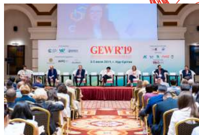
GEWR'19 280 participants 12 countries of the world